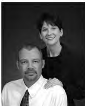
BMW CCA Members