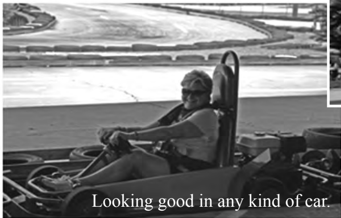
Looking good in any kind of car.

The Houston BMW CCA met at Go-Kart Raceway on West Mount Houston Road to enjoy go-carting. Unfortunately the "Super Go-Karts" were not as fast as some speed demons would have liked. Maybe we will try MSR next year.