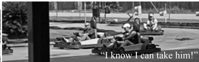
"I know I can take him!"