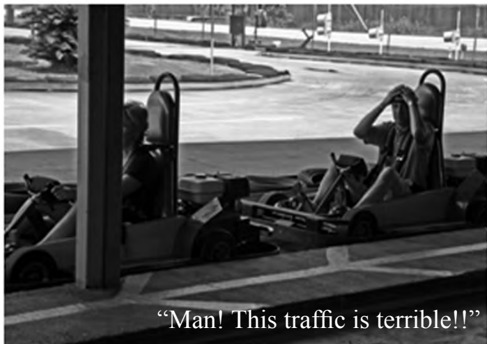
"Man! This traffic is terrible!!"

Back at the condo we enjoyed our favorite libation and continued to discuss the aspects of the drive. There was a certain feeling of having conquered ol' 7 that convinced us this would not be our last drive on that incredible stretch of road. Another drink and a bunch more laughs and it was time to call it a night – tomorrow was the dreaded drive home, but we left knowing we accomplished our goal over three days, with an exciting long drive, a lot of laughs and some wonderful food and scenery. We could not help but to feel lucky for the opportunity to drive Highway 7 in one of the finest automobiles made.