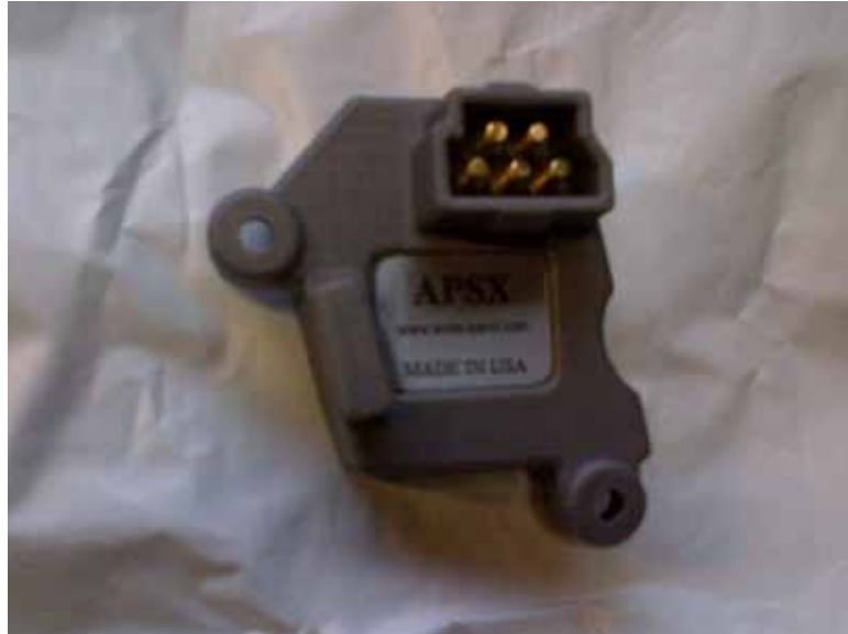
Figure 2 APSX replacement FSU

Checking eBay I found an interesting replacement part. Sold by APSX2010, it is a replacement part that is a totally different design, claimed to do the same thing as the factory device, but does not generate the heat of the factory unit so does not require the large heat sink. At about $42.00 shipped it was worth a try. Figures 2 and 3 show the part received.