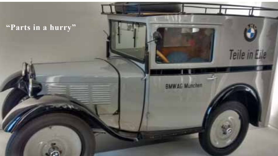
“Parts in a hurry”

The famed cylindrical corporate offices are off limits to visitors, but has been used for movies such as Buck Rogers in the 25th Century (as their “headquarters”).