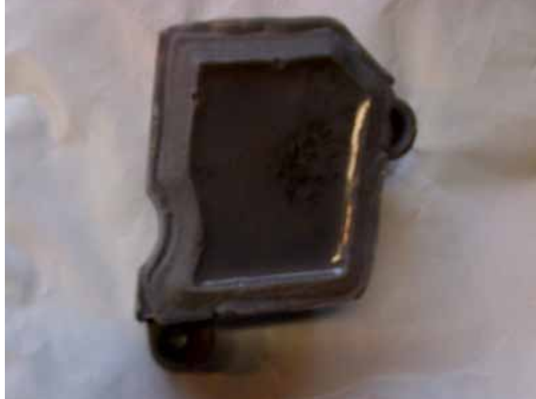
Figure 3 Back side of APSX FSU, no heat sink

The part appears to be a 3D printed housing.