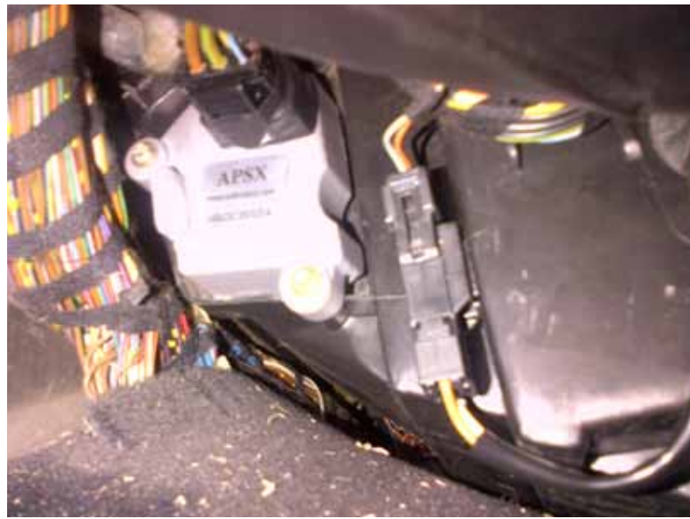
Figure 4 Installed new unit

The FSU is retained with two (2) T-20 torx head screws. Figure 4 shows the installed unit.