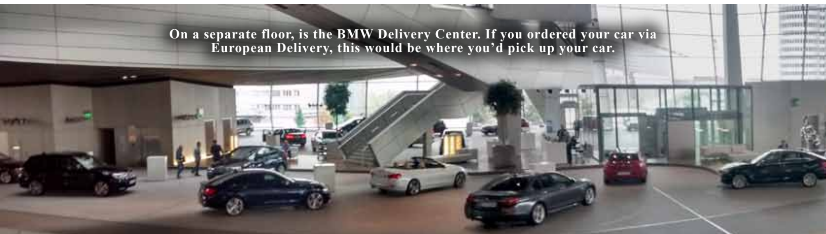
On a separate floor, is the BMW Delivery Center. If you ordered your car via European Delivery, this would be where you’d pick up your car.

And, on a totally separate wing, there was the BMW America manufacturing showcase with a few X cars, and a movie clip playing in a loop about the manufacturing facility in Spartanburg NC.