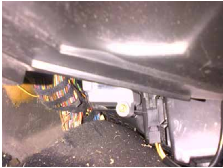
Figure 5 FSU installed with panels

The new unit fit right in but I wanted to test it before putting the trim back in. When I plugged it in the connector was pretty tight and the clip didn't quite line up. It worked, so some electrical tape (3M 33+) was put around the connector as insurance.