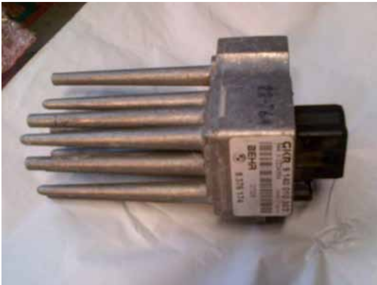
Figure 1 Final Stage Unit

If the display goes completely blank, there is a good chance the device in Figure 1 has failed. BMW calls this the Final Stage Unit (FSU).