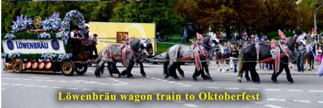
Löwenbräu wagon train to Oktoberfest

Oktoberfest is more than just about beer, it is a carnival for everyone, young and old to enjoy. You can walk the grounds and just watching people going by. There is a historical parade with bands and beer wagon trains prior to the official ceremony at 12:00 pm when the Mayor of Munich taps the first barrel of beer to open Oktoberfest. Be there by 9:00 am if you want to watch the ceremony. The joy of being there with friends should not be missed and walking through the Oktoberfest is magical, it's like a different world. People are in a good mood, and everyone talks to everyone like we all party together.