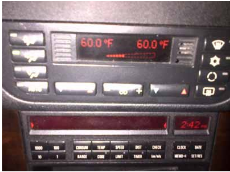
Figure 6 Working display and control now

The blower in this car is working good ever since and now approaching a year since installation. Admittedly I took a gamble on this part, but so far a good deal.