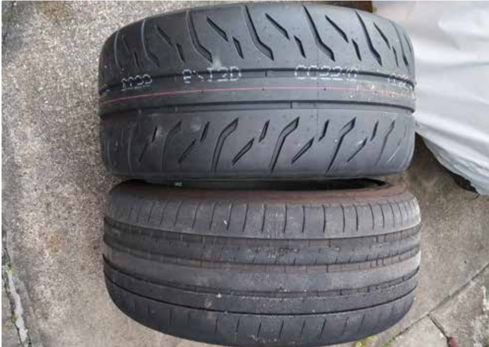
MORE THAN JUST BLACK RUBBER: 255/40-18 Michelin Pilot Sport OEM front tire (left for F80/F82 (2014-Current M3/M4) on a 9" rim compared to 275/35-18 Bridgestone RE-71R on 10" rim. The Bridgestone RE-71R has a wider profile with heavier shoulders and deeper tread pattern than the stock Michelin Pilot Sport.

have two (2) overdrive ratios. To increase performance, normally lowering the gearing is beneficial. For Autocross where most drivers stay in 2nd gear during the completion of their lap, top speed in second is a consideration. For a street car the engine cruising RPM on the highway can change overall comfort of the car, so is also an important consideration. Typically tire changes can effect engine RPM in the range of 1 to 4%. The normal recommendation from tire and wheel dealers is not to change diameter more than 1/2" either plus or minus. For performance, a smaller diameter lowers gearing and is normally the most trouble free for tire fitment. Tire Compound The rubber compound of a tire is what creates the "grip" of the tire to the pavement. It also determines the wear characteristic of the tire. Dry or wet traction is heavily influenced by the rubber, but also by the tread design. Want the best dry traction, use a slick or DOT legal racing tire. Wet traction is a mix of rubber compound and tread design. The tires ability to pump standing water away from the road surface is very important with any standing water. Unfortunately for most daily drivers, we can not just pull out a set of wet weather tires as most race cars do. Therefore, it is desirable to have tires that perform well in both dry and