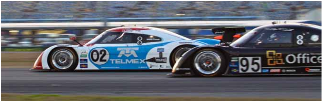
6 • Spring 2011 Torque of the Town